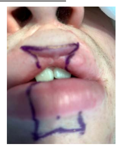
Fig. 3. Abbe flaps for upper-lip replacement have always made the full height of the upper lip regardless of the amount of skin being replaced; lower-lip replacement flaps were boxed (not triangular) and tailored at any level necessary

All patients were placed on a clear liquid diet for one day, a pureed diet for two days, and then onwards normal diet. Tooth brushing was encouraged. Internal prostheses were always removed. In the office, 2,5 to 3 week after the reconstruction, the pedicle was injected with 1 to 2 ml lidocaine with epinephrine 1: 200000. After 10 min, the flap was divided with a No. 10 blade and inset. Mucosal tissue was undermined for closure; however, no significant mucosal adjustments were made. Resorbable sutures were placed in the oral mucosa.