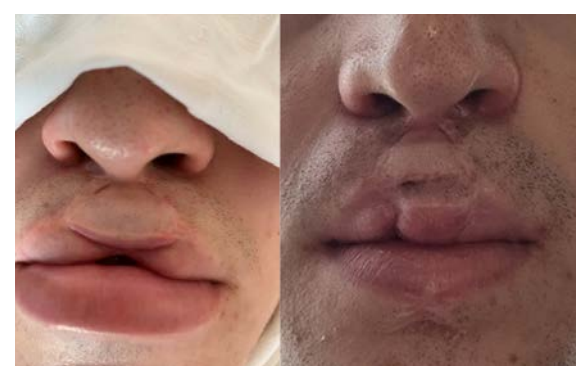
Fig. 4. Each patient showed a more natural contour of the vermilion tubercle and the Cupid's bow. The scarring of the donor site was inconspicuous